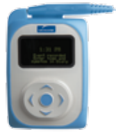
IQholter™, EX, EP