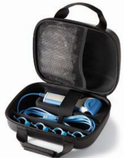
Spirometer carrying case

For information, pricing or to place an order, contact us at: 1-800-624-8950 or 1-310-516-6050 or midmark.com